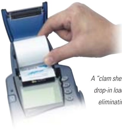
A “clam shell” printer facilitates drop-in loading, virtually eliminating paper jams.

Like all VeriFone terminals, the Omni 3700 family requires little training—saving hours of handholding and help desk time. The familiar interface puts needed functions at clerks’ fingertips. Lastly, the “clam shell” printer features trouble-free, “drop-in” paper loading to virtually eliminate paper jams.