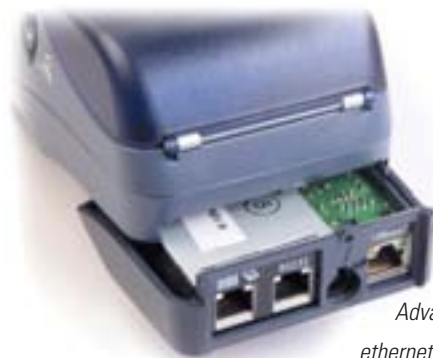
Advanced communications module supports dial, ethernet, or ISDN connectivity.